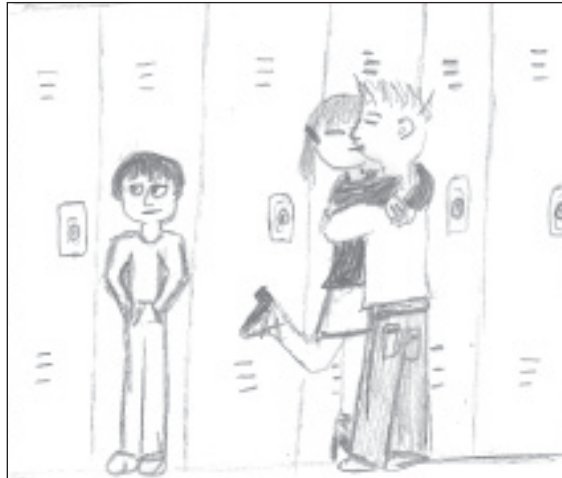
GRAPHIC BY Heather Barnes/Bagpiper

Besides making others uncomfortable, PDA takes away from academics and can make other students jealous. On the other hand, some students only get to see each other during the school days and have a lot of pent-up affection for each other. Younger teenagers tend to be